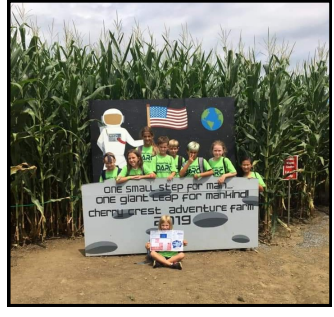
Adventure Camp at Cherry Crest Farms